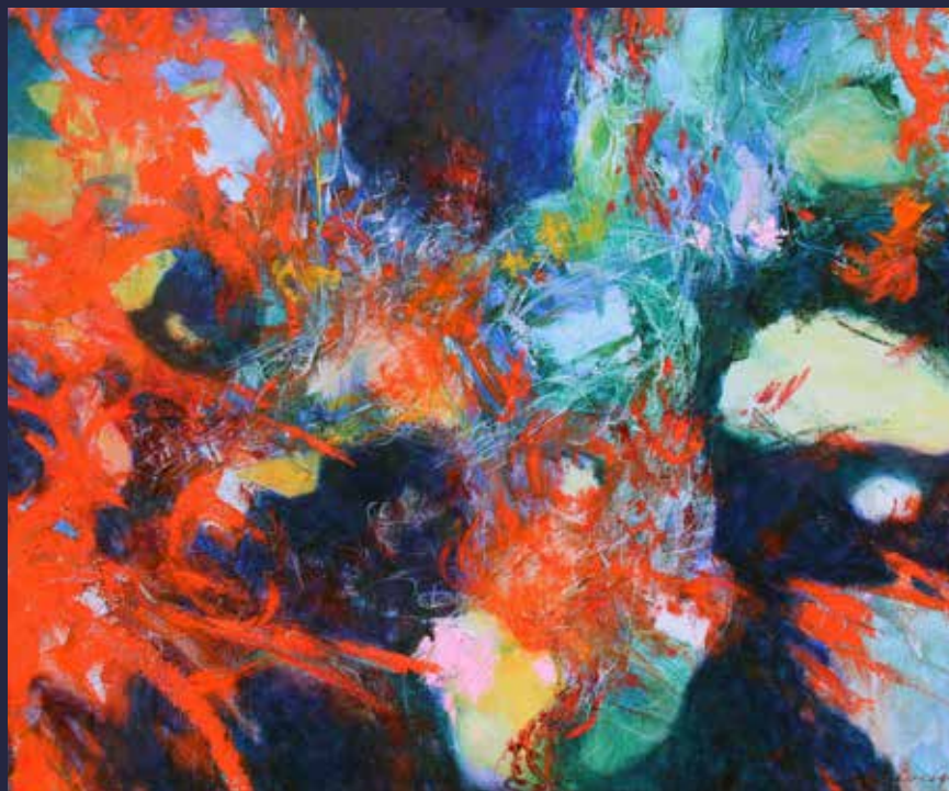
Vivement l'Afrique / Oil on canvas 61 X 76 cm Work by Benoît Lévesque www.benoitlevesqueart.com Used with permission. All rights reserved 2022.

Bas-Saint-Laurent Centre-du-Québec Chaudière-Appalaches Estrie